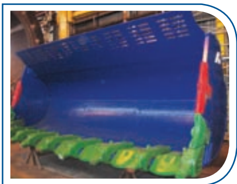
CAT 994D Heavy Wear Kit