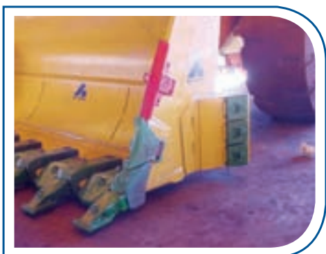
CAT 994D Heavy Wear Kit