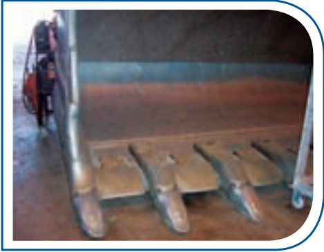
Bucket undergoing maintenance