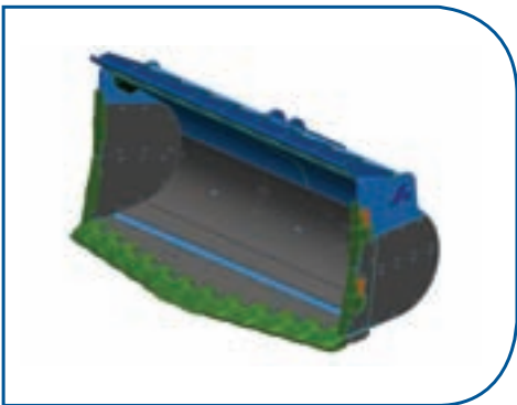
Komatsu WA900 Heavy Wear Kit Concept

'Bradken has the experience, knowledge and facilities to design and manufacture a wear liner package for any front-end loader bucket'