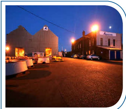
Scunthorpe - single source supply: Pattern, casting, machining and assembly

Quality castings, value added services and pride in workmanship.