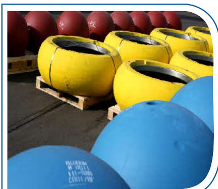
Grinding mill components