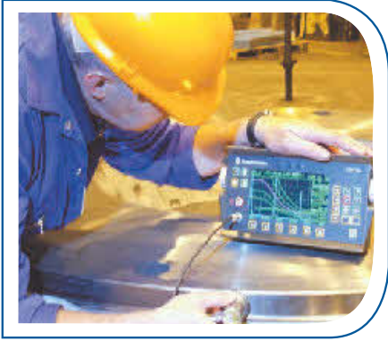
Inspection and testing