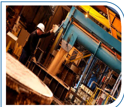
Semi-mechanised production line