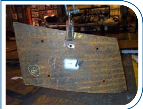
Duaplate D100 panels for a Paul Wurth chute