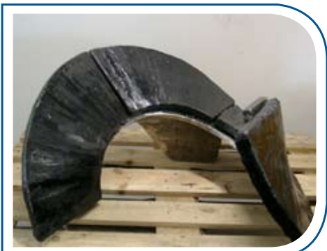
Duaplate D100 screw feeder segment