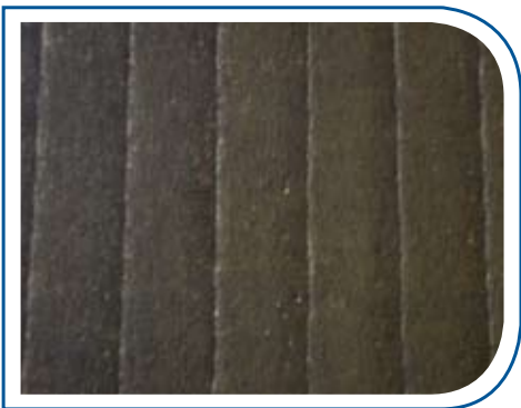
Typical D100 finish