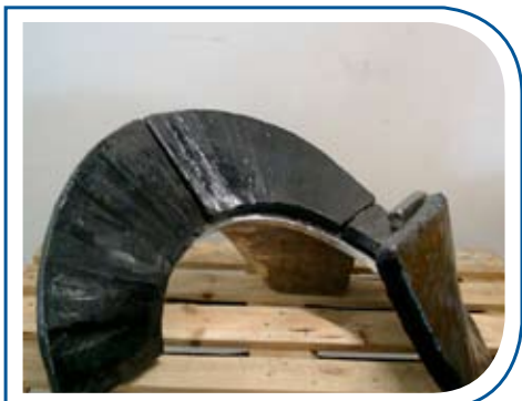
Vidaplate V45 screw feeder segment