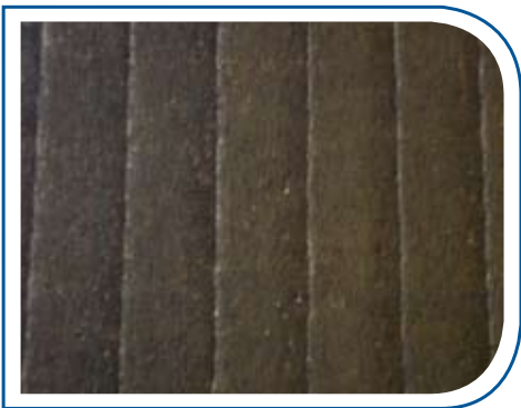
Typical V45 finish