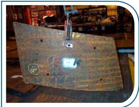
Vidaplate V45 panels for a Paul Wurth chute